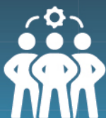
SUPPORT TO PGS GROUPS