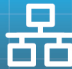
IRRIGATION NETWORK SYSTEM