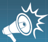
ADVOCACY AND PROMOTIONS